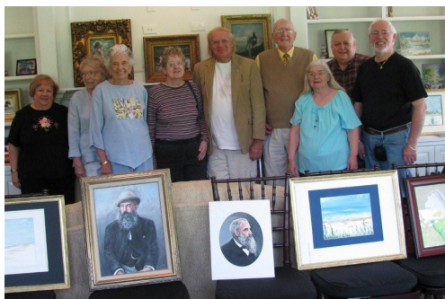
The Senior Center's Artists "Art in the Park"