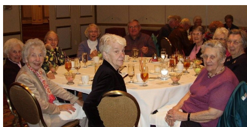
Bobby Vinton Luncheon